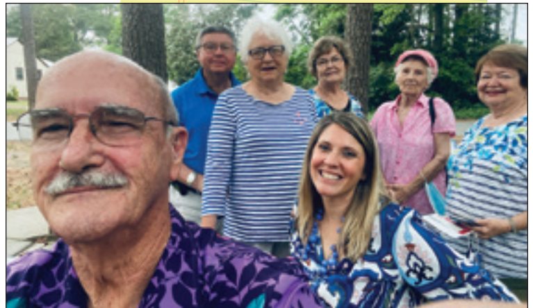
Care Village members enjoy going out together—attending educational workshops, local senior fests, or just out for lunch.

I got to see mom and dad yesterday and they are so appreciative of visits and cards from the Village members. Yesterday, my mom's anxiety seemed to be much lower. Just wanted to let you know you are making a difference in their lives. Keep up the good work NCBAM!