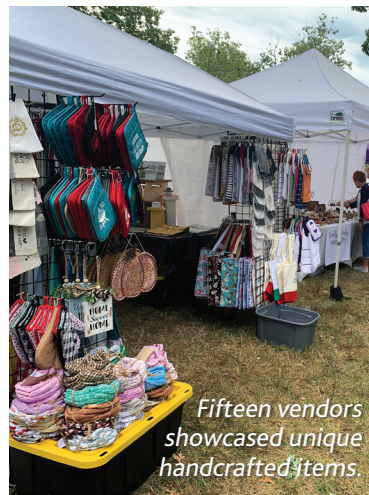
Fifteen vendors showcased unique handcrafted items.